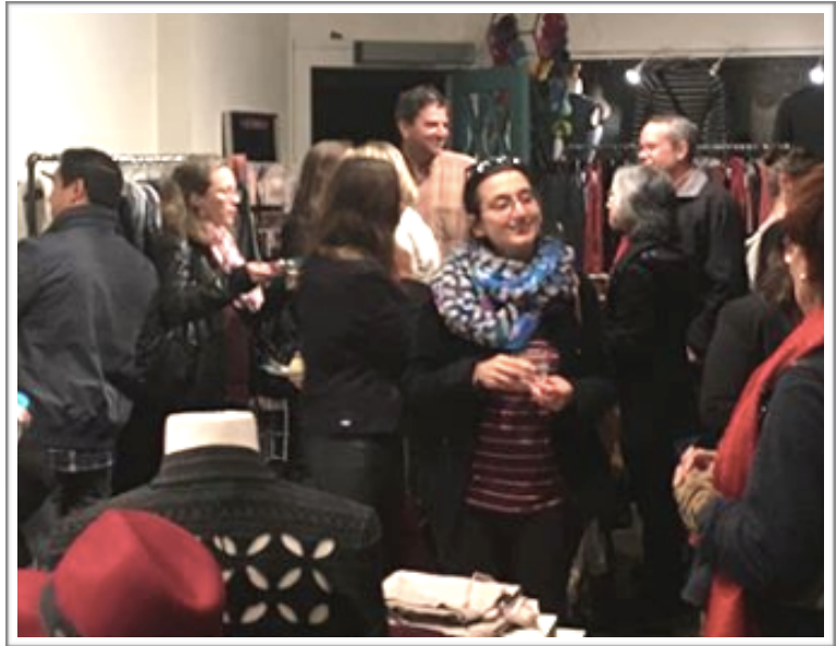
ALAYA Boutique - The community gathers to celebrate ALAYA Boutique's 32 years of successful business in the Inner Sunset

Merchant memberships and strong community engagement have remained the cornerstones of ISMA since its founding over 90 years ago. Our sincere thanks and appreciation to current/past/soon-to-be merchant members, our local institutions and the dedicated residential community that make the Inner Sunset such a thriving, enduring San Francisco destination.